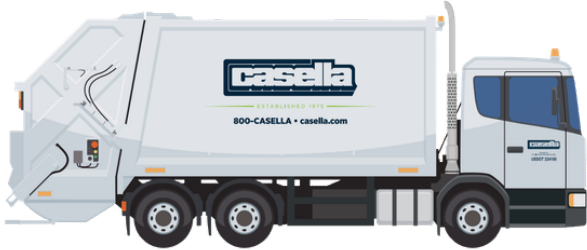
Casella rear-load truck currently used in Auburn

The City of Auburn is currently serviced by Casella using a rear-load truck. The operation requires one driver and one helper, also referred to as manual collection. As the truck drives down the road, the helpers are on the back of the truck, hopping off to pick up trash and recycling and manually throwing it into the hopper.